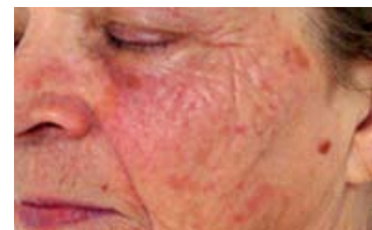
Before Fractional Ablation