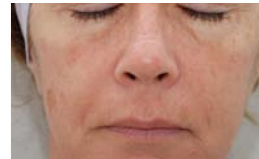
Before Fractional Ablation