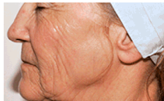
Before Fractional Ablation