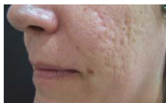
Before IMPACT for Acne Scars