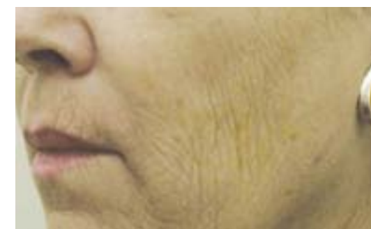
Before After Fractional Ablation