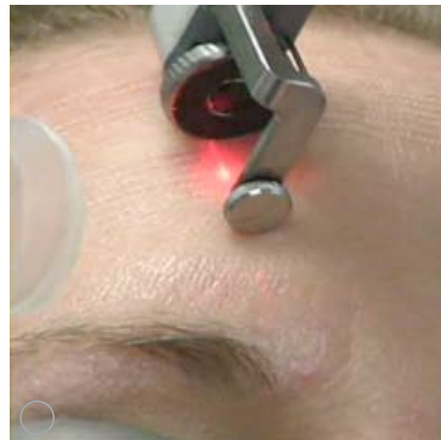
Fractional ablation results in less edema and downtime