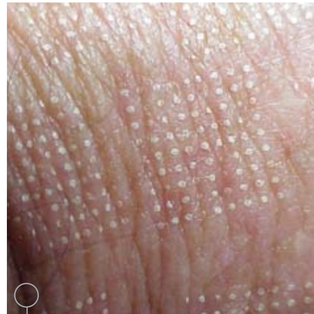
CO 2 roller for fast fractional ablation