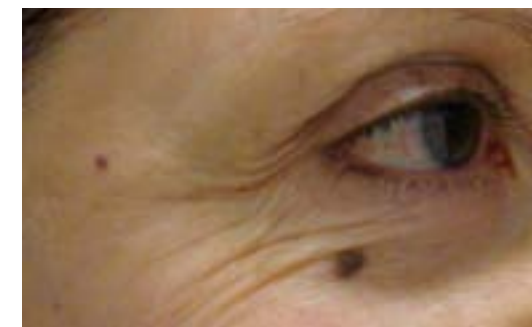
Before Fractional Ablation