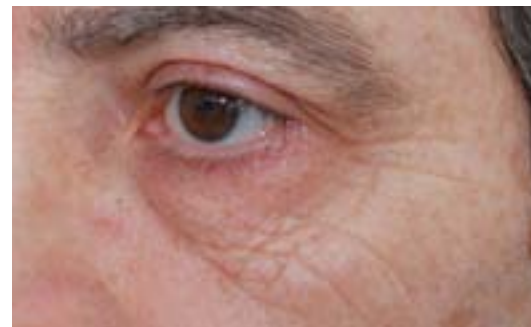
Before Fractional Ablation