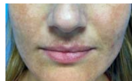
Before iTED for Melasma